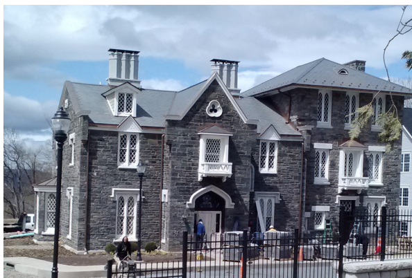
Preservation of the historic Kane House on the property developed by Avalon Bay earned the developers a density bonus.

One factor that could contribute to the village's success is the strong real estate market; Ossining is in the metropolitan area of New York City and therefore experiences significant development pressure. Additionally, the desired list of public goods has been set out in the comprehensive plan and village zoning code so that citizens, developers, and local officials start out on the same page.