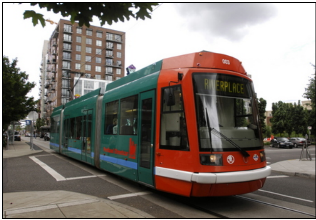
[Figure 3] Dense Housing near the Portland Streetcar Source: Oregon

Live <a href="http://blog.oregonlive.com/pdxgreen/2007/12/planning_association_hails_met.html">http://blog.oregonlive.com/pdxgreen/2007/12/planning_association_hails_met.html</a>